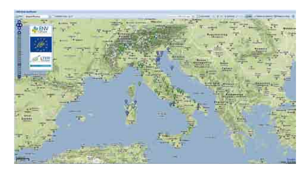
The geoportal, which presents the Italian sites involved in the LTER network. Green markers: terrestrial sites; light blue markers: freshwater sites; blue markers: marine sites (Credits: LTER Italia).

Fixed measuring stations and oceanographic buoys are fundamental to understand and manage the marine environment. This is particularly important in dynamic coastal areas, given the delicate balance between