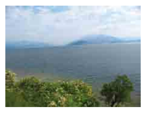
Lake Garda, the largest in Italy, is surrounded by mountains and represents a major environmental as well as an important tourism area. Monitoring activities help protecting the ecological status of the area despite the multiple leisure activities.

The possibility to monitor these lacustrine ecosystems permanently, through Space-based services and in situ observations, can provide many answers about the impact of human and natural modifications, biodiversity loss, global warming and the increasing occurrence of natural hazards.