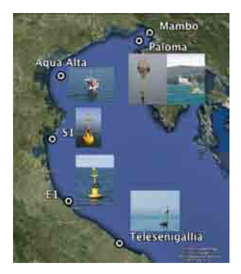
Map of the buoys and fixed platforms in the NW Adriatic Sea (Credits: CNR-ISMAR).

currents along the column with ADCP, temperature at surface and bottom, salinity, turbidity, oxygen, chlorophyll-a and sea level) with a series of meteorological stations and oceanographic instruments. A direct view of the sea's condition around the tower is available continuously thanks to three high-resolution webcams installed on the roof. Two underwater webcams are installed at -3 m and -12 m to observe biological populations and to monitor potentially critical phenomena such as jellyfish swarms etc.;