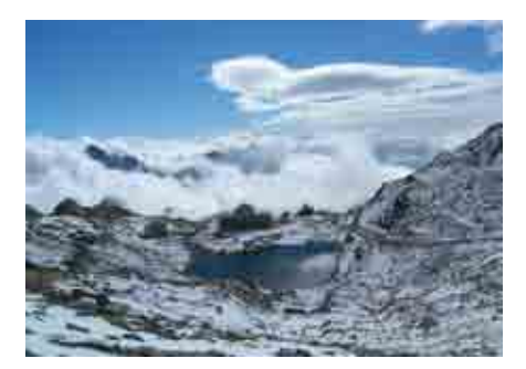
The Angelo Mosso mountain research station (2901 m ASL - Monte Rosa Massif, Italy).

Environmental Protection of the Valle d'Aosta region (ARPA Valle d'Aosta).